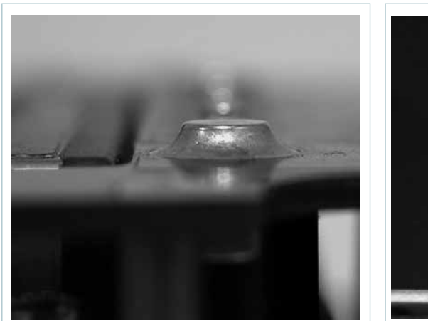
Figure 3 (right) Maxi / Mini output power pin and Sense pin

Figure 2 (left) Side profile of a Mini module solder joint